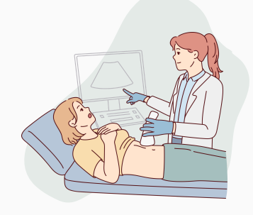
THE PHCG ULTRASOUND & PREGNANCY TEST